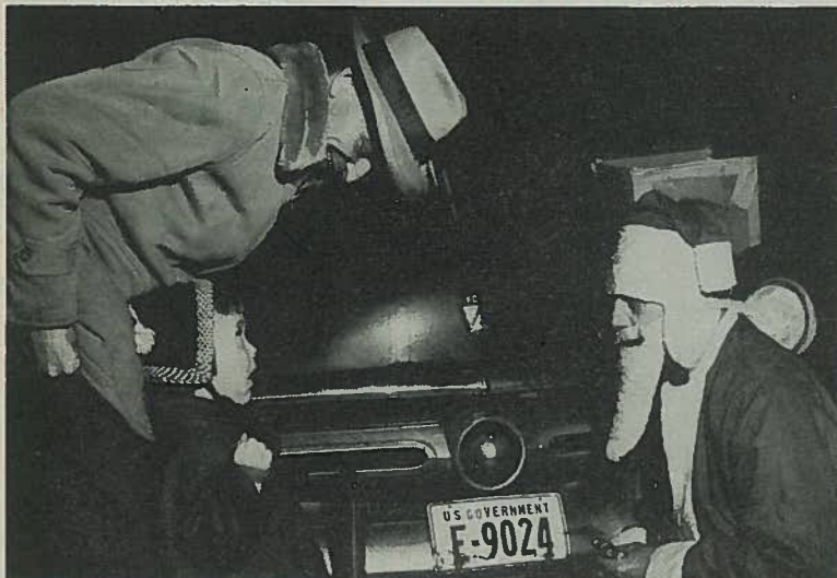
The expression on the little face above is only one of many similar seen on the faces of more than 4000 area kids who delighted in talking with Santa during the past two weeks. The recreation division sponsored tour is conducted annually for the benefit of employee families throughout the area. In all, more than 40 villages were visited in a period of five days.