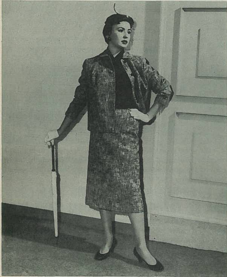
"A costume suit of wool tweed, navy flecked with white . . . The box jacket uncovers a navy crepe wrap-around blouse . . . the straw sailor is the small hat story for spring . . . and is worn straight over the head . . ." This description and many others will fill the air as the model shown and eleven others parade before the Atomic Area's women at their fashion show scheduled at the Lake White Club.